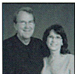
Lloyd & Laurie Carr

The Lloyd & Laurie Carr Scholarship extends an award of $3,500 to one outstanding freshman applicant to the University of Michigan - Ann Arbor. The Lloyd & Laurie Carr Scholarship does consider economic need , (as determined by the Office of Financial Aid at the University of Michigan).